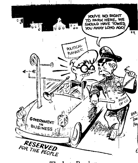
The Law Breaker