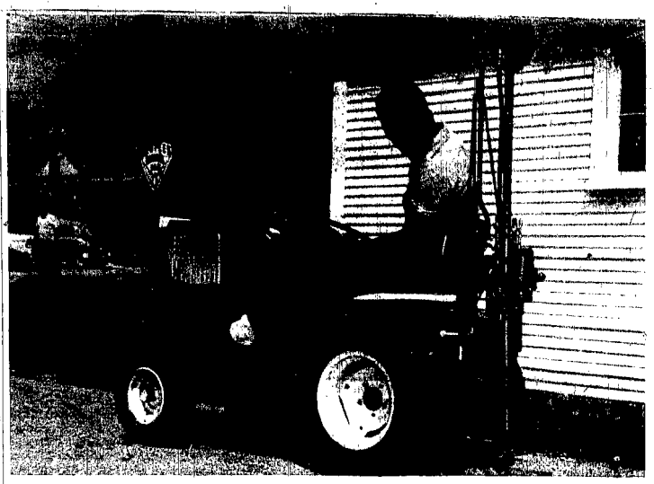
THE "GAS HOUND", LATEST ADDITION TO Peoples Natural Gas Co. equipment in Wayne can sniff out escaping natural gas at a depth of 18 inches below the surface of the ground. In fact, that's its function. It is used for early detection of possible gas leaks on mains and service lines. It has its own hollow drill that goes

In the final first-round elimination game Wayne rolled passed Coleridge 9-1. Though out-hit 6-5, Wayne capitalized on four